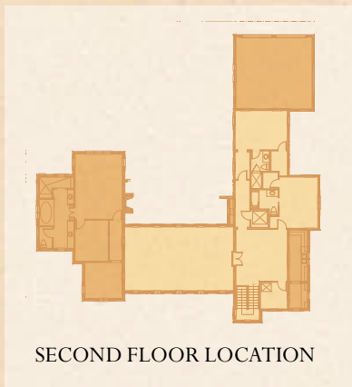
SECOND FLOOR LOCATION